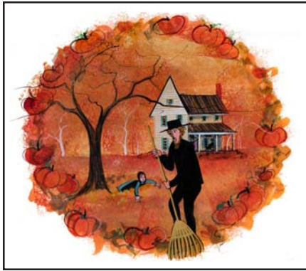
"Seasons of Love, Autumn" Nineteenth Members-Only Print