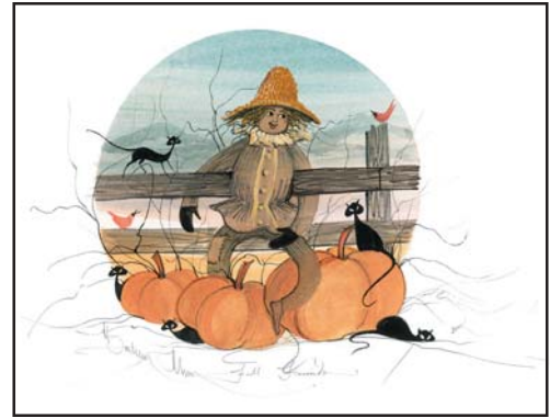
"Fall Friends" Sixth Junior Members-Only Print