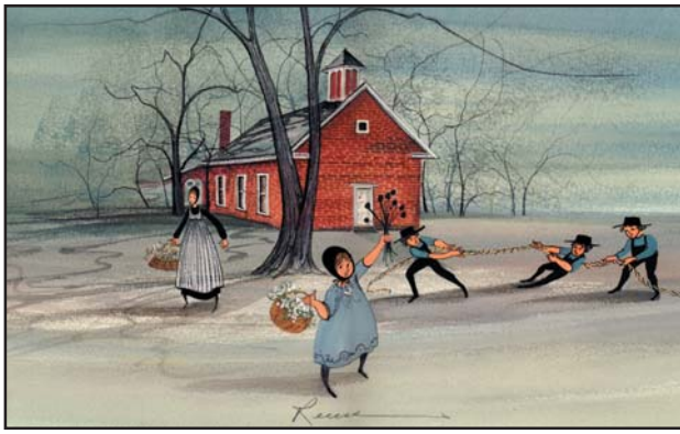
2005 membership card "Recess"

pursuing a Master of Arts in Teaching from Mary Baldwin College in Staunton, with an add-on endorsement in special education. She taught agricultural education for a year before serving as the Executive Director for the Virginia Future Farmers of America Foundation. Although she enjoyed working with this non-profit organization, she realized that her true calling was teaching.