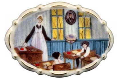
"Today's Lesson" membership brooch

• The Society office had been located at the same address in the Village Outlet Mall in Waynesboro for 13 years. Because the facility was placed up for sale and the owner did not wish to enter into a long-term lease, the office staff had to seek out a new location. When the existing lease expired, the Society negotiated a one-year lease with a 90-day opt-out clause. Considerable discussion occurred regarding using the former frame shop behind the