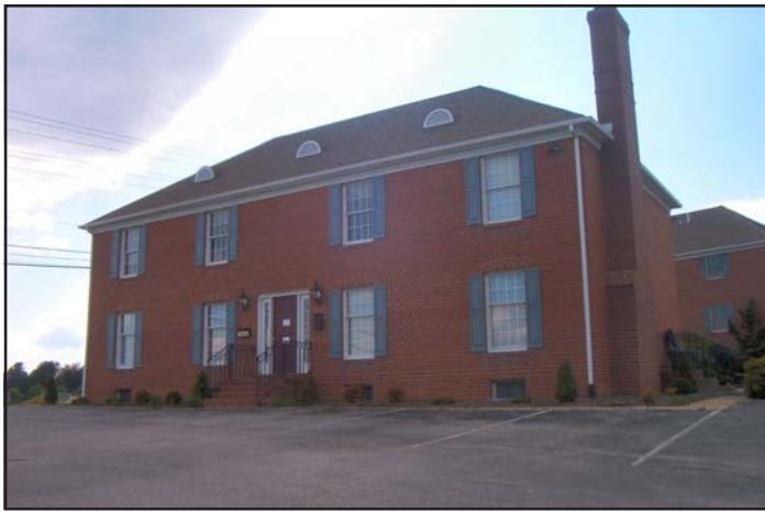
The Society's new office at 20 Stoneridge Drive

Museum, but it was deemed too small without significant additions and improvements. During the summer, the office staff packed up everything and moved it to a new site only a couple of miles away. The Foundation had shared the previous facilities since its founding, but it chose to move into the site at the Museum instead of accompanying the Society staff. In the summer of 2006, most of the buildings in the Outlet Mall were razed, including the former office.