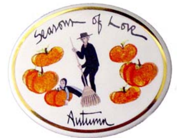
2005 porcelain nameplate "Seasons of Love, Autumn"

The Society again sponsored the dinner dance on Saturday night, this time using an informal theme of a beach party. It was fun to wear sandals, shorts, and Caribbean shirts